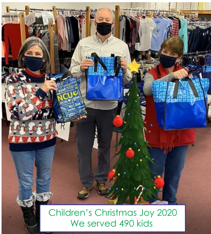
Children's Christmas Joy 2020 We served 490 kids