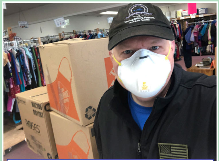
Volunteer delivering supplies to a local Homeless Shelter during the COVID Pandemic