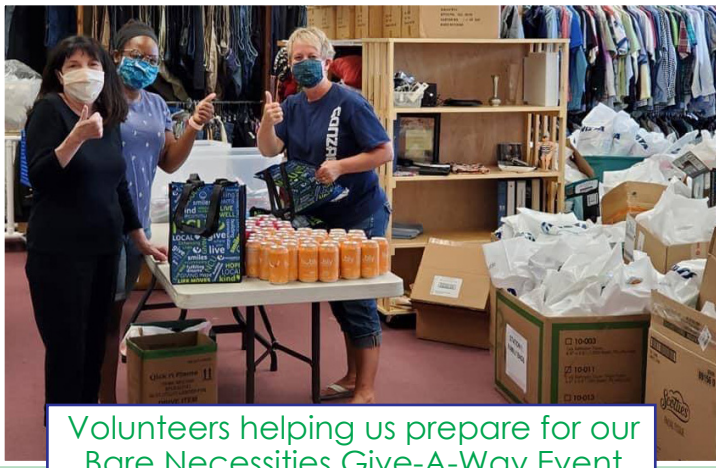
Volunteers helping us prepare for our Bare Necessities Give-A-Way Event