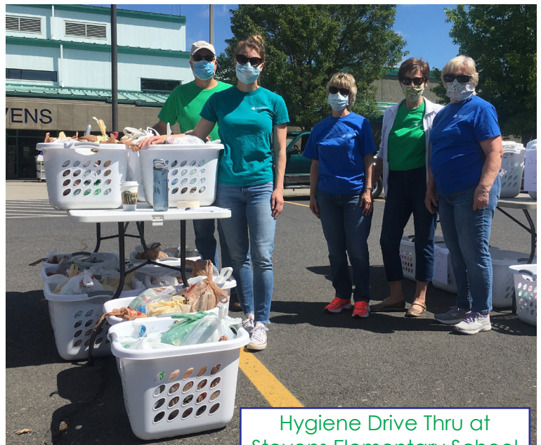
Hygiene Drive Thru at Stevens Elementary School