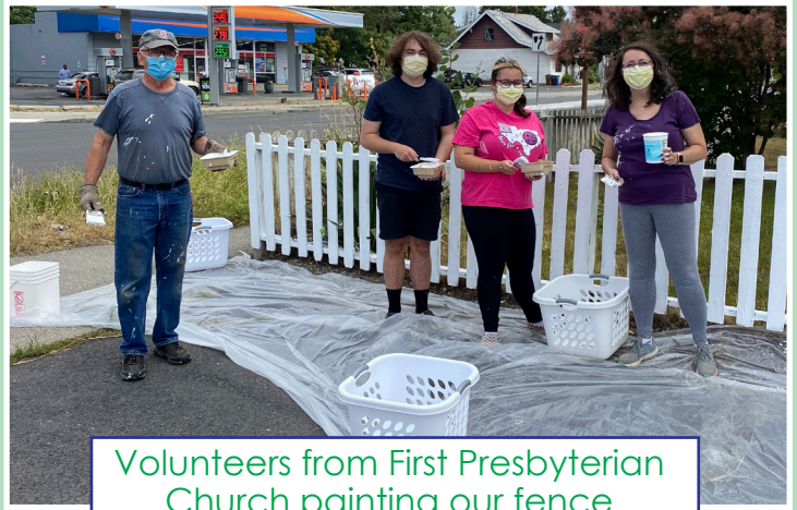
Volunteers from First Presbyterian Church painting our fence

"Just over two years ago, a homeless camp formed on the sidewalk in front of Spokane City Hall as a protest against the lack of an adequate warming center during winter weather. Toward the end of the week when the camp was there, it snowed one night. The next day the Police moved in and cleared out the campers and their tents. The images of that week and the struggles of the homeless campers challenged me to put myself in their position, and my reflections began to express themselves in this free-verse poem. Thank you for allowing me to share it with you."