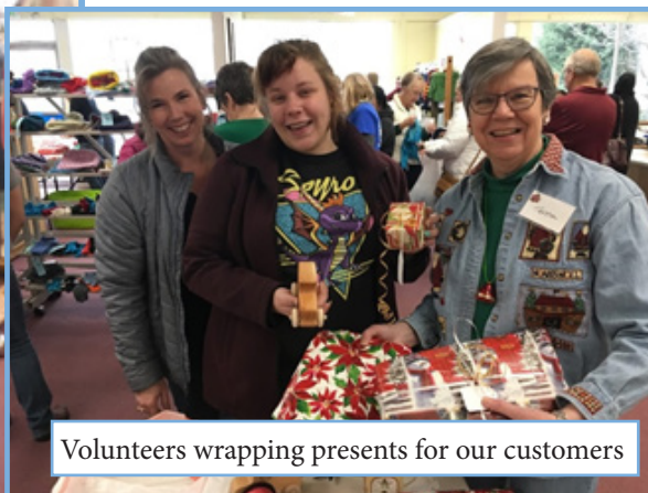
Volunteers wrapping presents for our customers